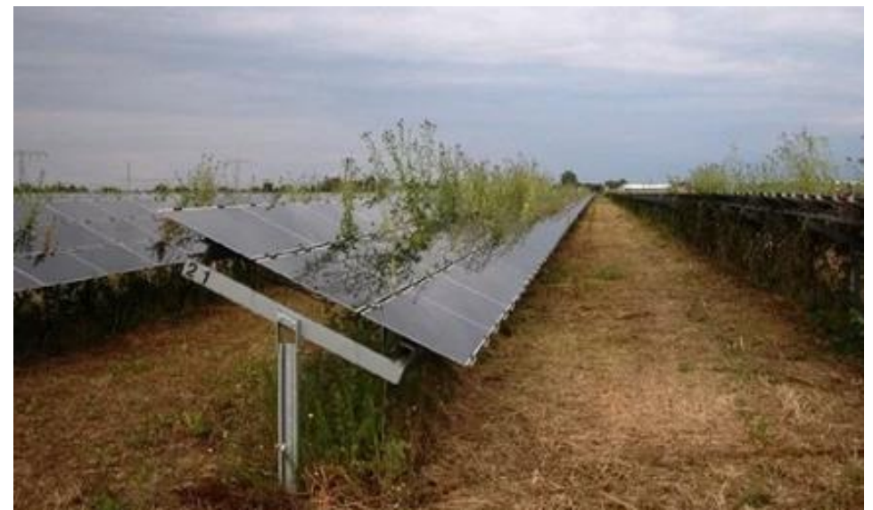
Figure 5. After mowing, prior to string trimming.

Grazing sheep on solar sites is a cost-effective method to control on-site vegetation and prevent panel shading (Figures 5 and 6). At no time in the growing season did vegetation shade the panels. It was less labor-intensive than traditional landscaping services and, thus, less expensive. The grazing trial at the Musgrave solar site was a full success for the site owners and operators, as well as the sheep farmer.