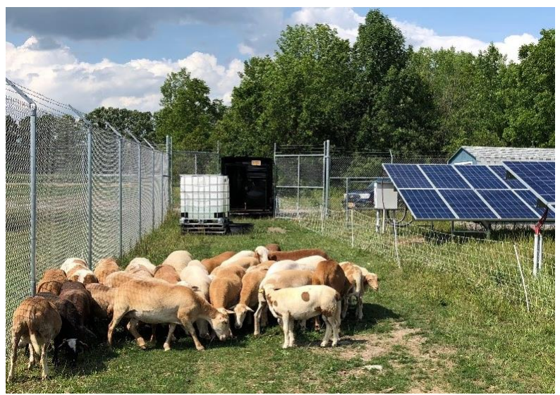
Figure 3. Water access and Electronet®.adding water to the water tank (Figure 3),<br/>checking animal health and welfare, and – when<br/>necessary – movement of the sheep into a new<br/>plot. All ewes were dry (non-lactating) when<br/>they were moved on site and breeding rams<br/>were introduced in September 2018 for January<br/>2019 lambing. No health incidents were ob-<br/>served. No signs of internal parasites were de-

The site was divided by permanent and Electronet<sup>®</sup> fencing into 4 plots for the grazing trial (Figure 1). The 56 Katahdin ewes (medium sized sheep less than 3 feet high with an average weight of 120 pounds) were rotated 8