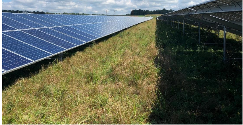
Figure 6. Rotationally grazed with sheep.

invasive species should be explored. An important question for the successful management of solar sites with sheep will be determining what stocking rates and densities should be chosen. Future research is needed to establish sound recommendations.