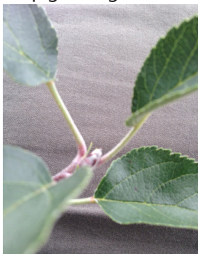
Terminal bud set