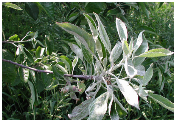
Figure 1. Mildew is growing out on shoot from overwintering infection of the vegetative bud last season.