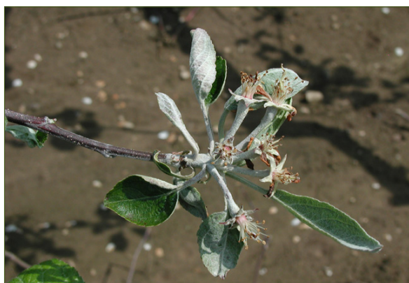
Figure 2. Mildew growing out from overwintering infection of the flower bud last season.