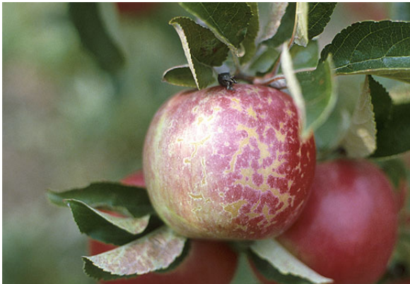
Figure 4. Mildew infection of fruit resulting in netted appearance of skin.