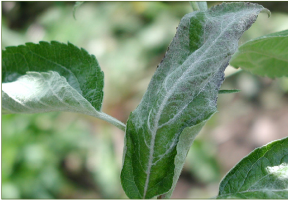
Figure 3. Mildew infection during the summer spreading to new leaves.