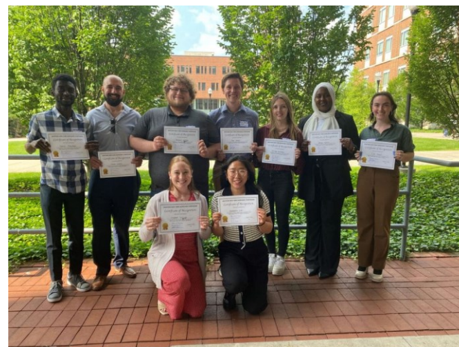
August 4, 2023 Western New York Inorganic Symposium at Rochester