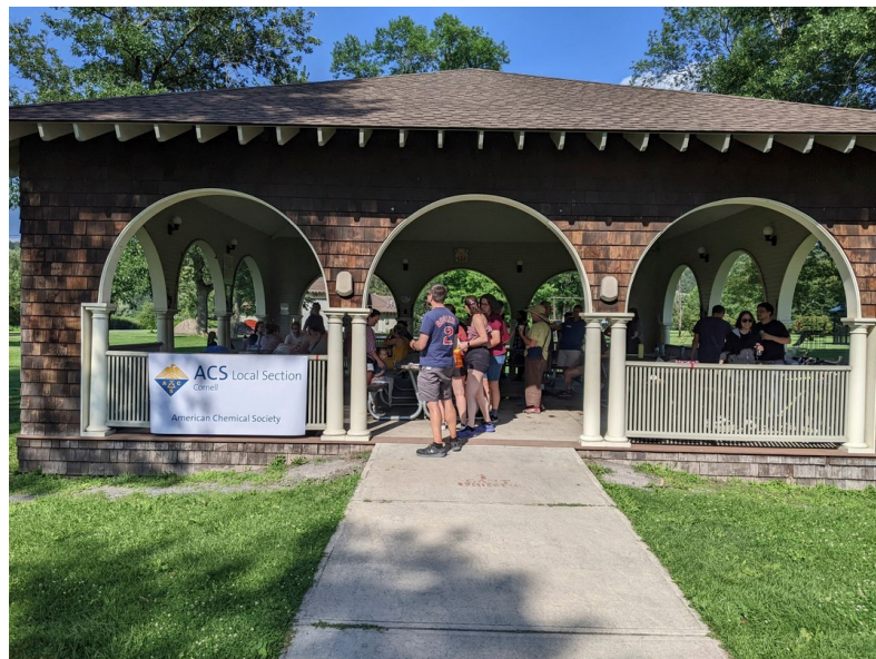
July 28, 2023 GAC-Cornell ACS Summer Picnic