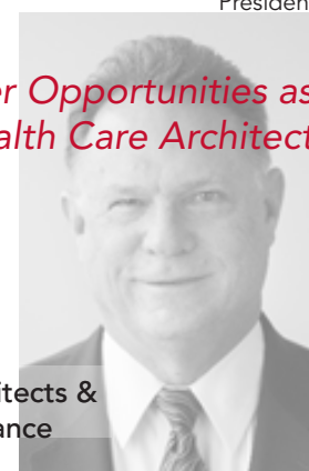
Steffian Bradley Architects & Sterling Planning Alliance

Career Opportunities as a Health Care Architect