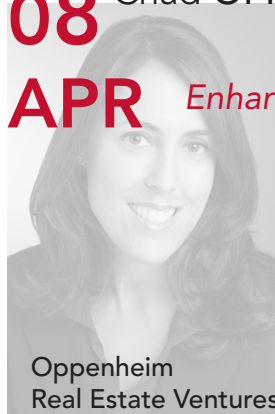
Oppenheim Real Estate Ventures