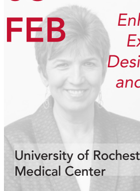
University of Rochester Medical Center

Enhancing the Patient Experience: Aligning Design, Administrative, and Hospitality Efforts