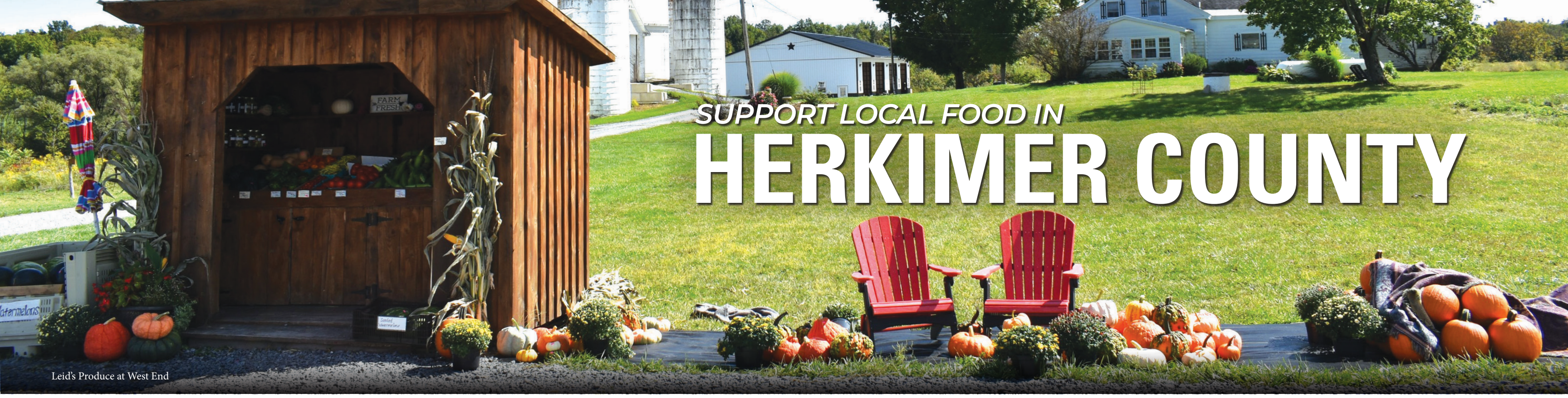
Leid's Produce at West End