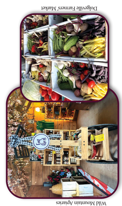
Dolgeville Farmers Market