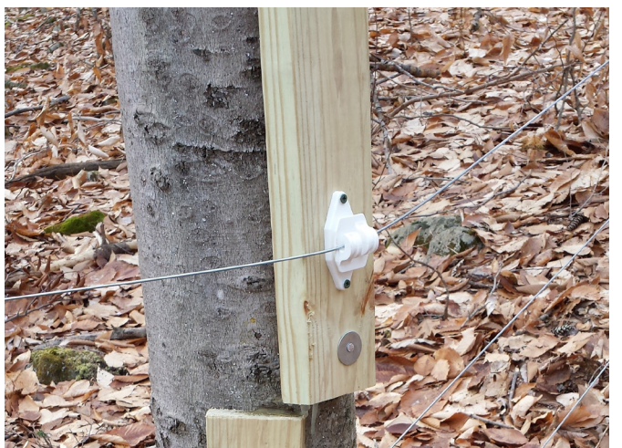
Figure 12. Batten strips can be custom fit as needed to tree shapes.