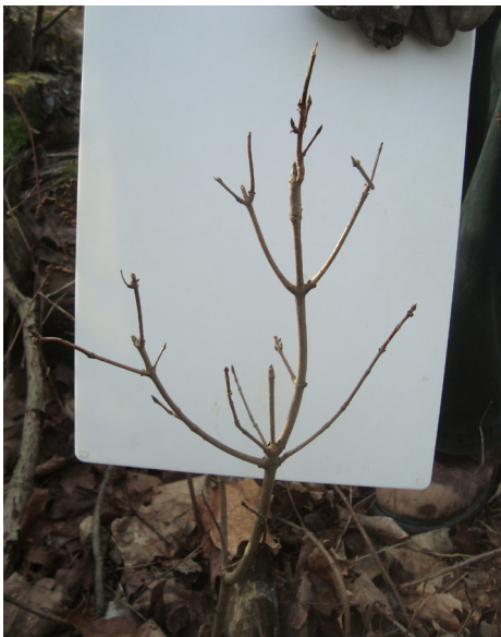
Figure 5. Repeated deer browsing removes the buds and forces lateral buds to expand, resulting in a bonsai-like seedling with little prospect for desirable form.