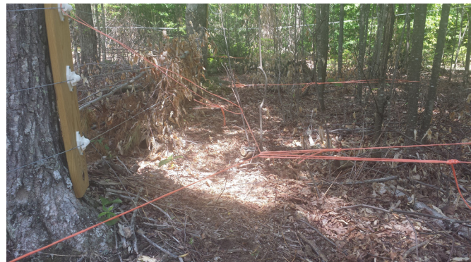
Figure 17. Baling twine attached around perimeter of fence.