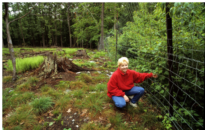
Figure 8. Woven wire fence 8 ft tall and suspended on installed posts is a proven method of limiting deer access to forest regeneration.