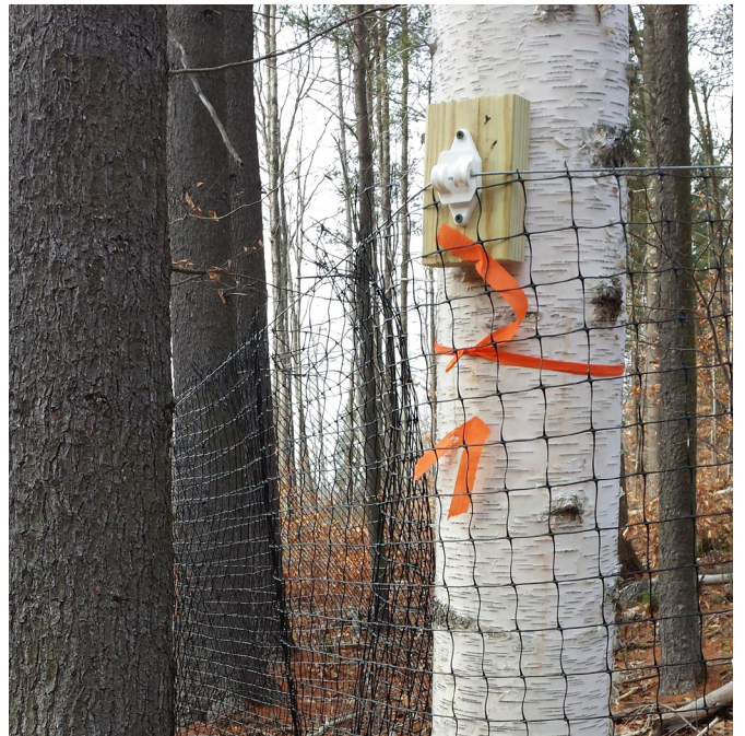
Figure 11. Flagging on paper birch identified this tree as a “fence post” tree.