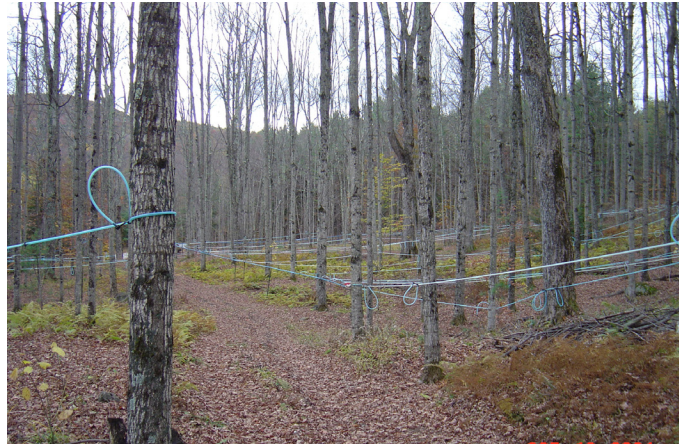
Figure 3. An open, park-like understory in this sugarbush is a combination of too much shade and too many deer.

Protection of isolated trees is possible with wire cages or tree tubes. Several tree tube designs are available (Figure 6). Tree tubes should be at least 5 ft tall and with ventilation ports to allow air circulation. Tree tubes need to be securely staked to the ground, and checked annually to ensure the tube is functional and the bottom in full contact with the soil (Figure 7). Tree cages made from 2” x 4” welded wire or poultry wire should be 5 ft tall and well staked. Some nut trees and conifers may do better in larger diameter cages than in tubes. Weed