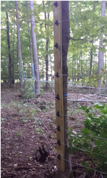
Figure 18. Use of a deck board as a batten strip and 8 strands of high-tensile wire