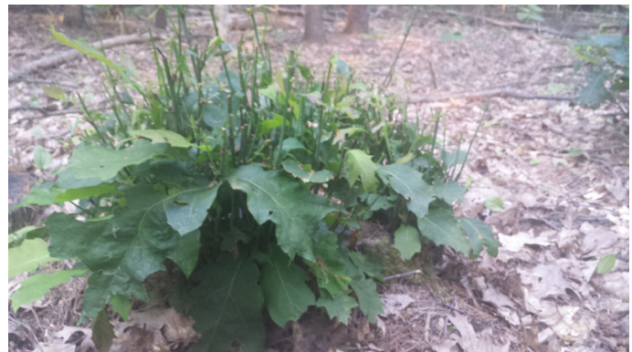
Figure 1. Browse impact of deer on stump sprouts.