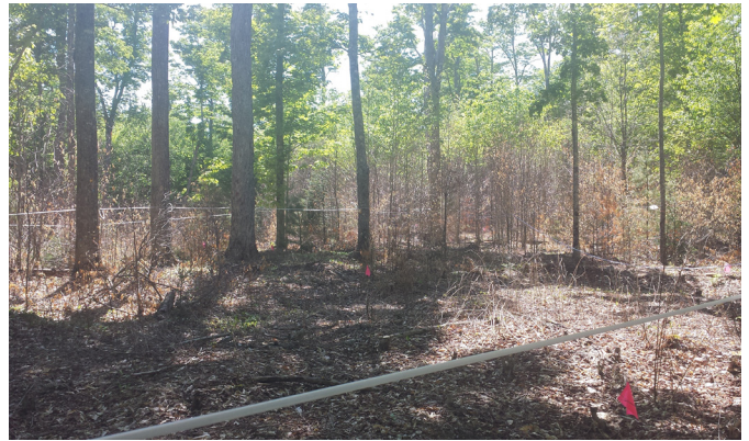
Figure 10. Enclosed area treated with herbicides to control interfering vegetation.