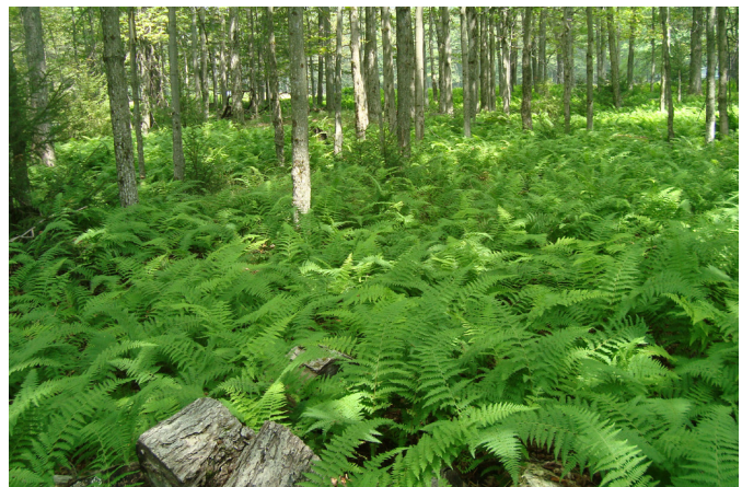
Figure 4. Ferns often dominate in areas with high deer pressure, and can interfere with natural regeneration of desired trees.