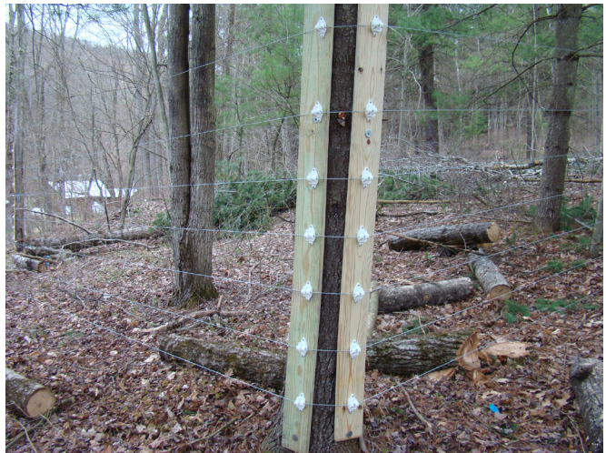
Figure 16. On abrupt corners, double batten boards may be necessary to protect the tree. Abrupt corners increase resistance when pulling wire around perimeter.