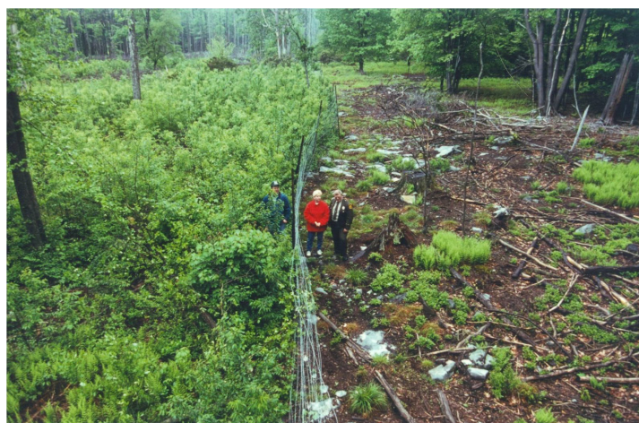
Figure 9. For large areas such as this regeneration cut, a fence is most cost effective, as shown on this 4 – 5 year old regeneration cut in Pennsylvania. With high deer pressure, the effectiveness of these fences can be dramatic.

management around the tube or cage is necessary to improve seedling growth, and will limit habitat for rodents that might girdle the seedling.