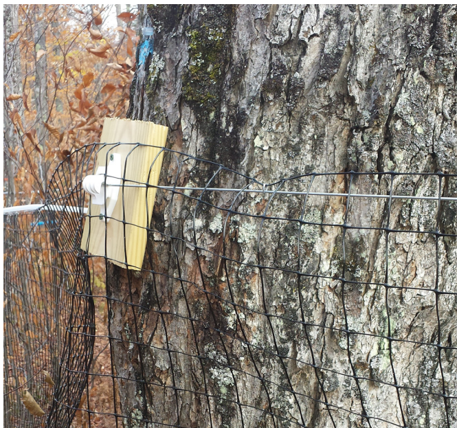
Figure 13. Plastic mesh fence with single wire strand and batten strip.