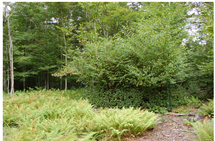
Figure 2. Small enclosures are simple and relatively inexpensive tools to assess the impacts that deer have on forest vegetation. By excluding deer, vegetation may be able to respond and illustrate the intensity of deer browsing.