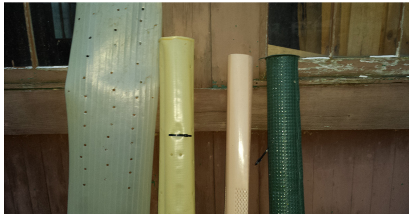
Figure 6. Examples of four tube types, both cylindrical and flat designs, the latter being assembled into a cylinder. All are 5 ft tall. Not presence of air-ventilation holes to reduce accumulation of hot air.