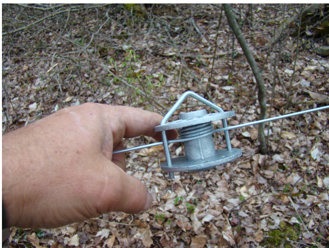
Figure 14. In-line tensioners used to tighten the 12 gauge wire.