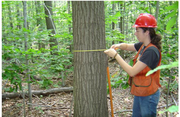
Figure 2. Estimating the volume of a tree begins with measuring diameter. The most accurate measurement is obtained with a diameter tape, or "d-tape" as pictured. Scale sticks and ocular estimation also provide estimates of tree diameter.

(Doyle) Board feet per log = (D-4)^2 \times (L/16) , where D is the diameter inside the bark on the small end and L is the length of the log in feet.