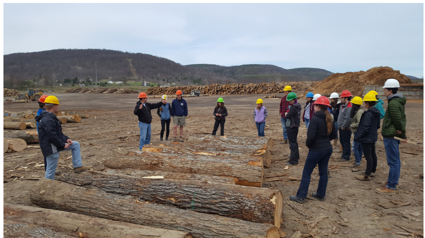
Figure 1. Tom Gerow of Wagner Hardwoods explains log scaling and grading to students. Purchased logs are arranged in the log yard to facilitate viewing the log for features of quality and defect (i.e., grading) and to measure log length and diameter of the small end.

The forest products industry is the primary user of these rules. Each sawmill has their favorite rule, and provide details and pricing for the trees and logs they buy based on that rule. Frequent users of rules will either convert volume estimates to their familiar rule, or