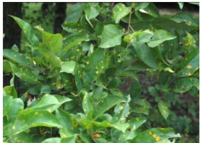
Figure 2. Apple leaves display bright yellow-orange leaf lesions.

juniper. Examples of rosaceous hosts are apple, crabapple, hawthorn, quince, serviceberry, and pear. Some commercial apple varieties are also highly susceptible to cedar-apple rust; fruit may be infected by the fungus, and infected leaves may drop prematurely causing potentially severe defoliation.