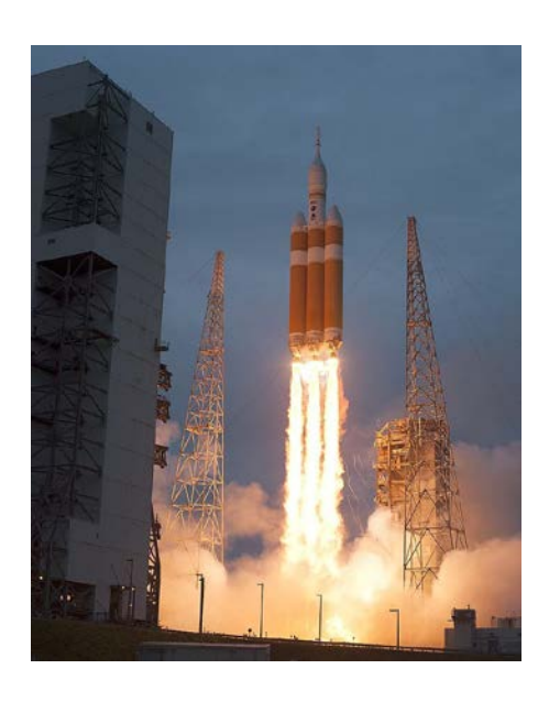
SPI Affiliated Faculty News

Six SPI students traveled to Cape Kennedy to view the Orion EFT-1 launch scheduled for December 4. Unfortunately a one-day launch delay and scheduled classes meant four had to return to Washington, D.C. before the launch. Two students were able to stay for the successful launch on December 5.