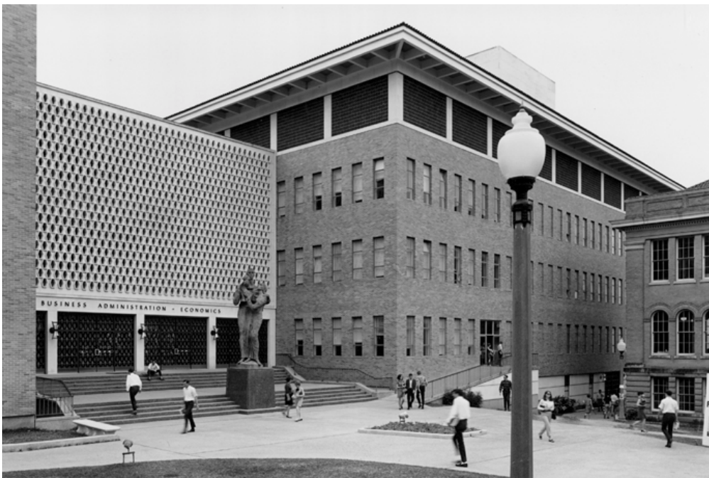
Business Administration—Economics Building