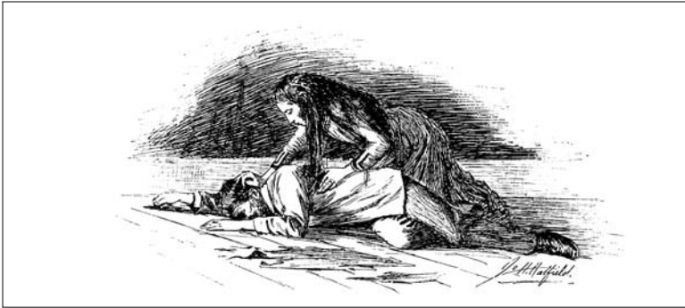
From "The Yellow Wall-Paper. A Story," by Charlotte Perkins Stetson (Gilman), New England Magazine 11, no. 5 (1892): 656.