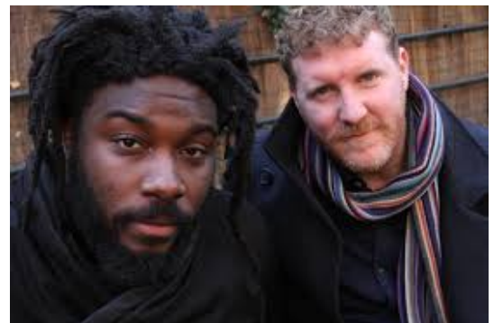
From left to right: Jason Reynolds and Brendan Kiely