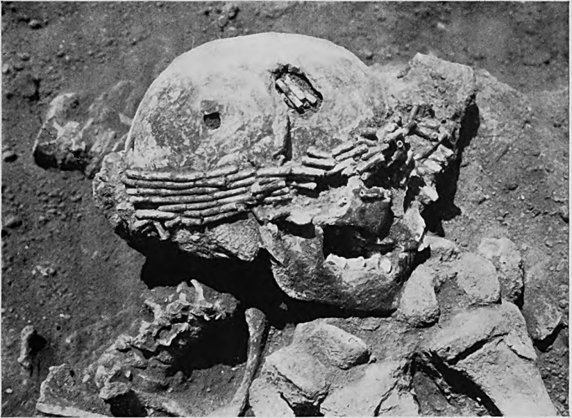
FIGURE 5. Skull from the skeleton reproduced in figure 4.