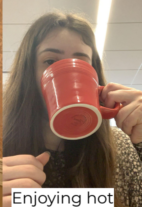
Enjoying hot chocolate from the drink maker in the office!

An image from one of my explorations of DC. Even though I am from the area, working in DC gave me more time to get to know DC.