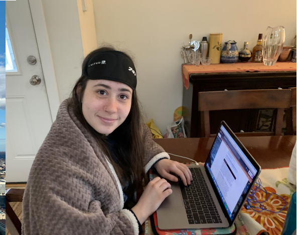
Working from home photo contest!