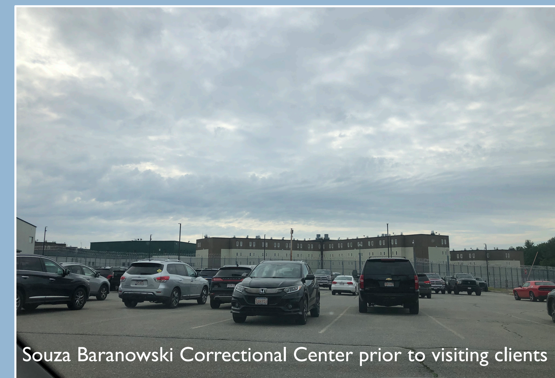
Souza Baranowski Correctional Center prior to visiting clients