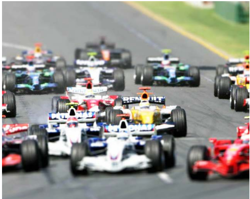
Formula 1 Racing (F1)

The most common cause of fatal injury and long term disability in auto-racing are repeated head injuries [1]. In 2010, the Centers for Disease Control and Prevention estimated that traumatic brain injuries (TBIs) accounted for approximately 2.5 million emergency department visits in the United States either as an isolated injury or in combination with other injuries. Among those individuals who presented for care, approximately 2% died [2]. TBI is most often caused by motor vehicle crashes, sports injuries, or simple falls. Types of head and neck injuries include concussion, skull fracture (basilar skull fracture without penetration of helmet by foreign body), vascular shearing, diffuse axonal injury, other TBI, and spinal injuries. The likelihood of injuries such as TBI is significantly increased in competitive motor vehicle racing, such as in Formula 1(F1), and consequently significant resources have been committed to design improvements that reduce the incidence and severity of injury during competitive racing. Understanding design innovations in competitive racing is invaluable as they form the catalyst, framework, and experimental sandbox for mass market auto safety innovations.