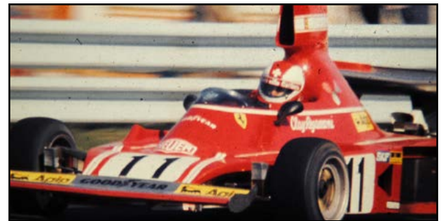
Formula 1; cc Christian Sinclair