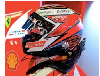
Development since the 1960s