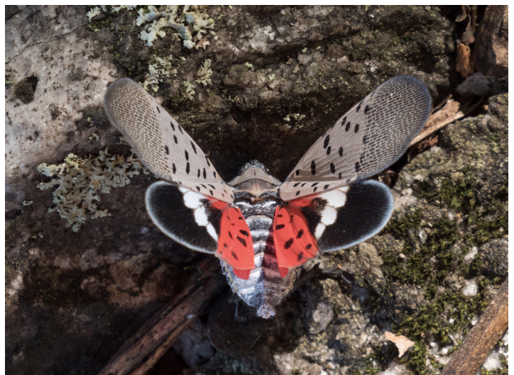
Adult Spotted Lanternfly (Lycorma delicatula)