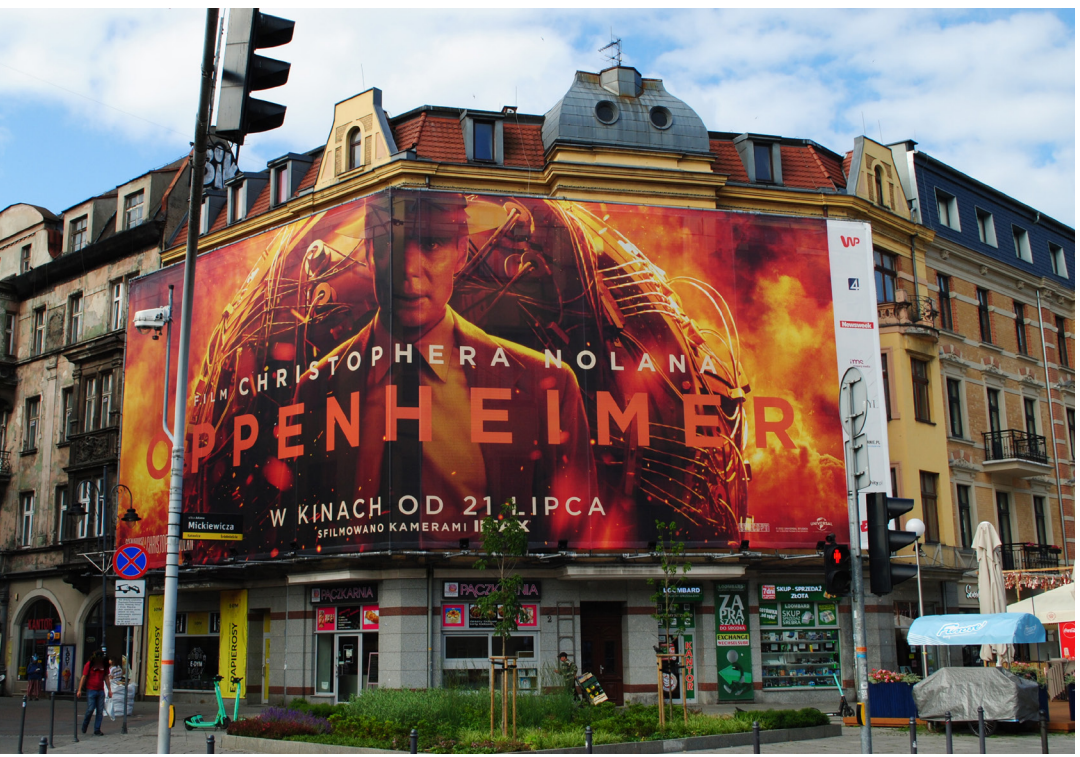
"Oppenheimer" released in theaters August 2023.

Oppenheimer advised against going ahead with more nuclear research because he felt haunted by the destruction and