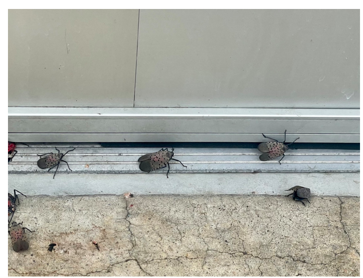
Lanternflies swarm around the SCC entrance.

"I haven't heard that they go after plants that pollinate...it seems to be