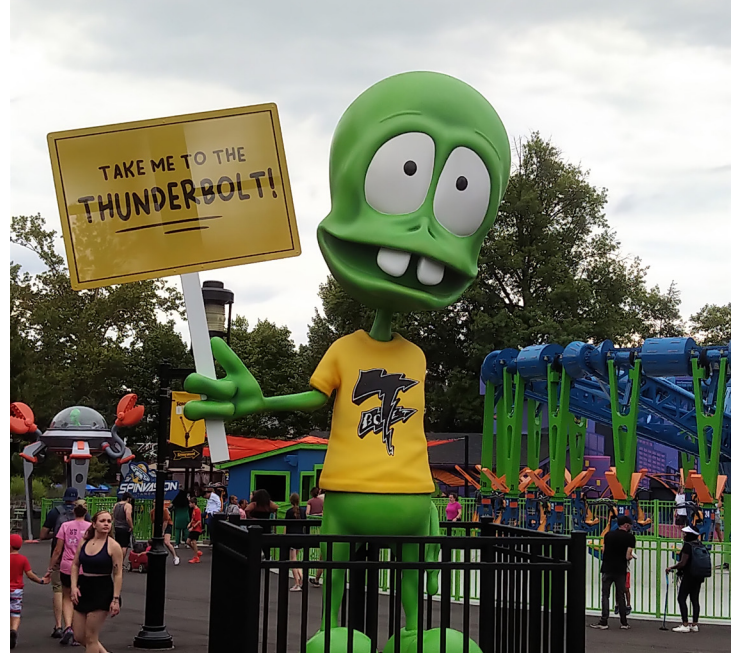
Kennywood park still open for fun.