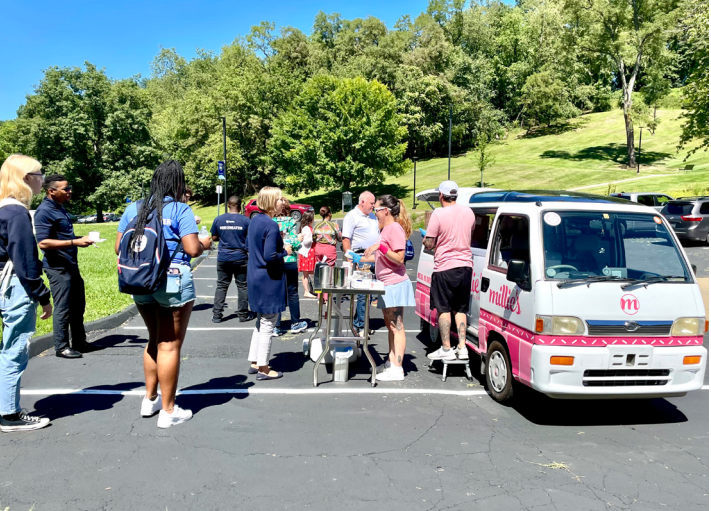
Students and faculty line up for Millie's Ice Cream Truck, provided by the First Evangelical Free Church.

The church has done other different things for students like "destressifying" by bringing snacks during finals or collecting food for the food pantry. The church has also always offered a "college and youngadult gathering" every