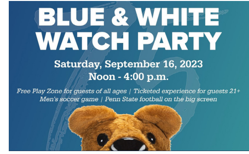
Register at ga.psu.edu/watch-party