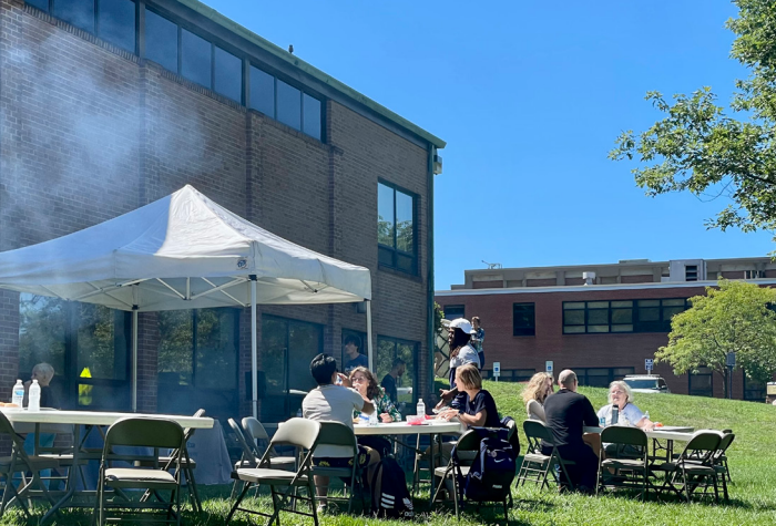
Faculty enjoying the free food provided by the First Free church.