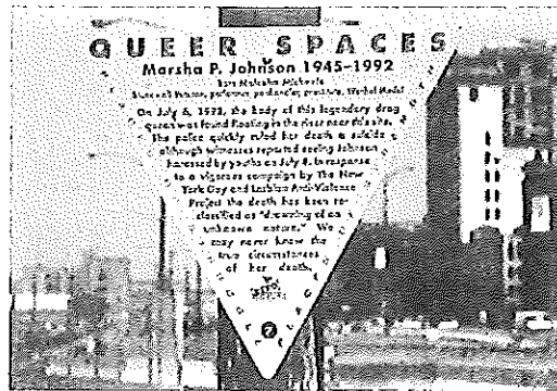
Figure 53.3 REPOhistory, "Marsha P. Johnson 1945-1992," (sign honoring the legendary drag queen and activist). REPOhistory, Queer Spaces, 1994. Screenprint on composite board.