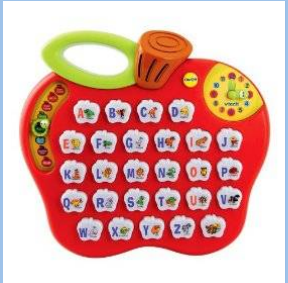
Vtech Alphabet Apple $20