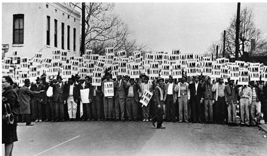
Figure 3. Becoming man. (Photo by Ernest C. Withers, I Am A Man , Sanitation Workers Strike, Memphis, Tennessee, March 28, 1968)

These are becomings, all: a lesbian becoming Indian, a black man becoming Man, a woman becoming animal. But putting it this way, there are at least two differences between the first two and the last one. The first two begin with a movement from the particular (molecular) to the general (molar), while the last one begins with a movement from the general-particular (human—but still only woman) to the particular. The first two, in other words, are majoritarian, the last one minoritarian. This first difference can probably explain the second, which