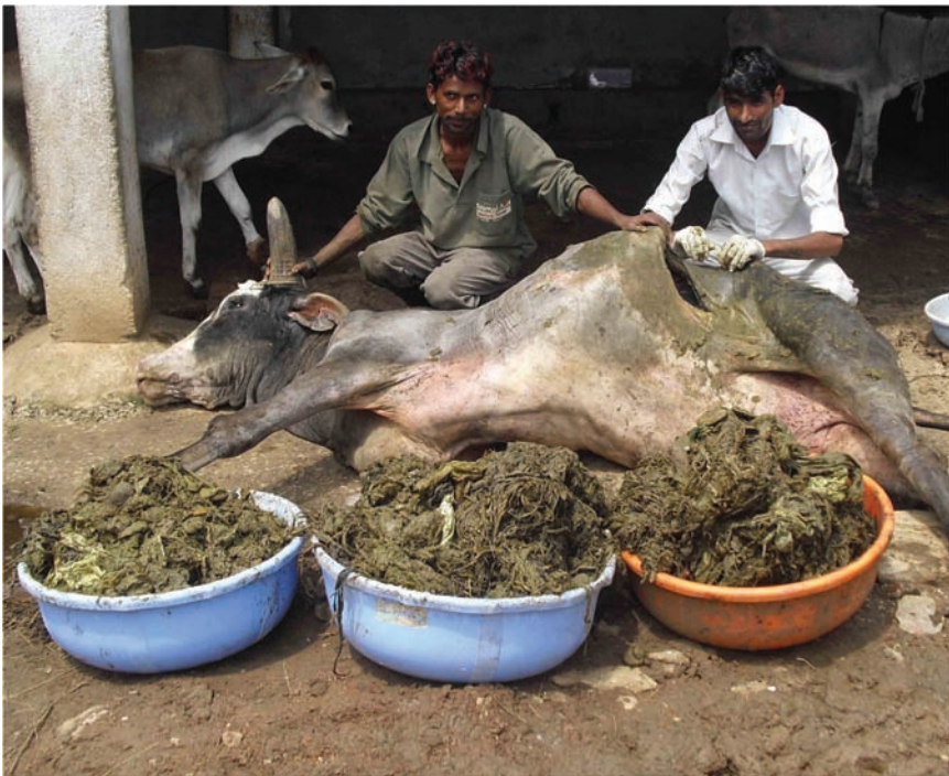
Figure 1. Death by rubbish.

just knowing that they were in the cabinet served a purpose. They would never let me stop.” She then told me about her illicit visits to the Idgah slaughterhouse in New Delhi, whose horrors she filmed and later had shown on the state-owned broadcast service, Doordarshan (an effort by the government, no doubt, to whip up anti-Muslim sentiment under the guise of compassion). The Idgah slaughterhouse has a capacity to process 2,500 animals per day for meat, leather, and by-products, but instead it butchers upward of 13,000 animals daily, around 3,000 buffaloes and 10,000 goats. 15 The animals are brought in from miles around the city, thrown from the trucks into heaps by their limbs, most with their legs already broken and some crushed to death from the journey. Boys and men begin the process of hacking and skinning the animals with rusty knives, the butchers barefoot and shin-deep in blood and shit. There are few sights more heart-breaking—or for those less sentimental than I, more ironic—than of sickly cows eating from the nearly one thousand pounds of cattle excrement, body parts, and clotted blood that the Idgah slaughterhouse dumps at a nearby landfill, a playground for kite-flying slum children, every day.