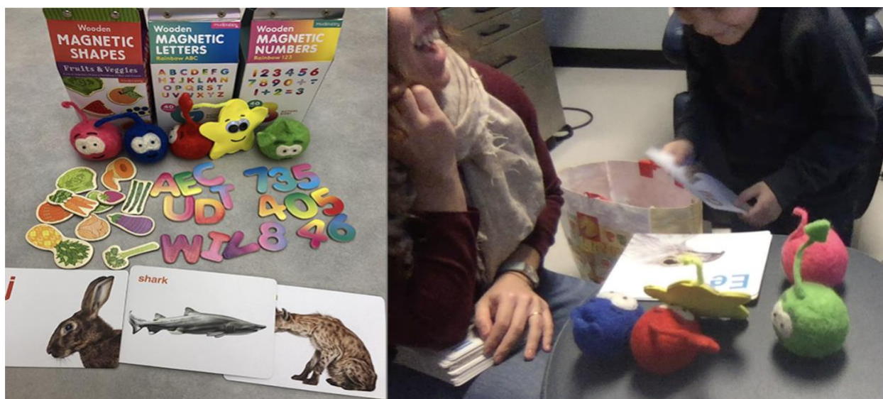
Figure 1. Design probes used for cascading participatory design sessions

We visited our collaborators at UC Davis Medical Center, where children with a corrected cleft are assessed by different medical experts, including speech pathologists, behavioral therapists, plastic surgeons, sleep therapists, dentists, etc. We were invited to take part in a “clinical day” where patients are assigned to a room while a variety of doctors rotate in and out to see each patient. Per the request of the speech-language pathologist and in order to minimize interference to the doctors’ rotations, we designed co-creation sessions that lasted 10 minutes, which would be conducted during “gaps” where no medical professionals were present in the patient’s assigned room. Seven children participated in our study whose ages ranged from 2 years, 7 months to 10 years, 9 months ( M = 6 years 1 month, SD = 3 years 6 months). They were accompanied by their parent(s), who observed them play and were also interviewed. We also interviewed 2 speech-language pathologists. In all, we collected data on 7 children, 7 parents, and 2 Speech-Language Pathologists.