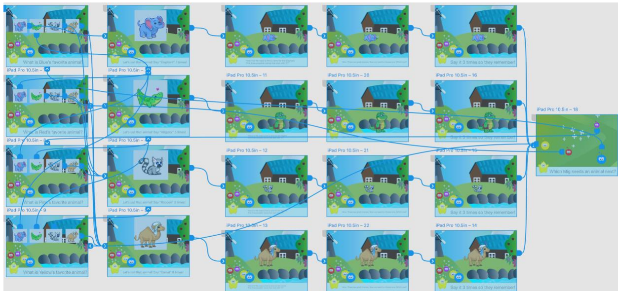
Figure 3. Adobe XD medium fidelity prototype of farm animals mini-game rapidly developed during gaps

The first design (see Figure 2) is a farm-to-table mini-game where players cultivate the crops needed to make a salad. In this mini-game, players pick the various fruits and vegetables by saying the name of the vegetable. If the salad requires five tomatoes, they would say tomato five times. During the Wizard of Oz Adobe XD playtests, we gained valuable knowledge about how we naturally support children and ideas on how this should be incorporated into the final product: It helps to repeat the same directions but worded in different ways. Different children can complete the same challenge in various directions. Silence and numerous incorrect attempts indicate confusion. We found the magic number to be three seconds of silence or 3 incorrect attempts in a row indicates the child might need support. If there is a list of items required, it helps to provide example solutions. The game should ask the child if they need help when they might be struggling. Sometimes they need more time to complete the task or a few more tries. We also found that children enjoy silly euphonic words like “pickle,” which may be more challenging to guess, but are more rewarding because they are fun to say.