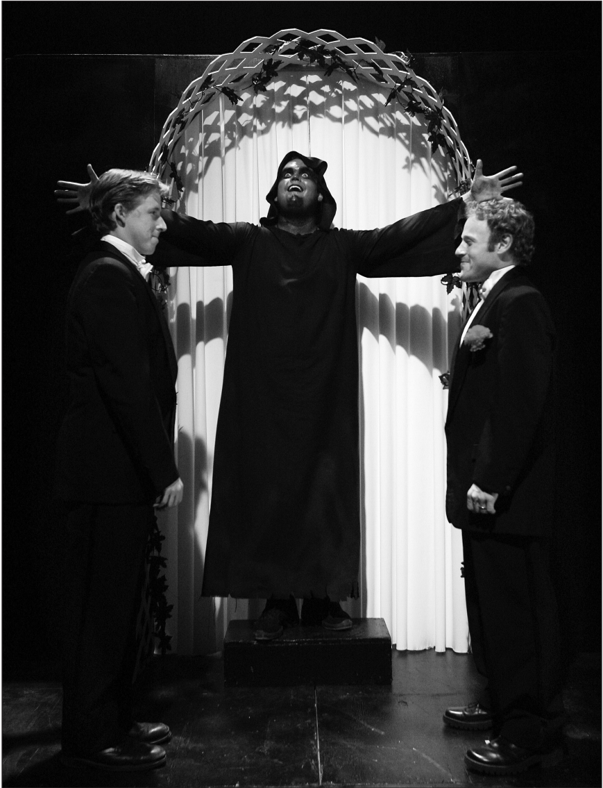
Figure 3. “Gay Wedding,” scene from Hell House .