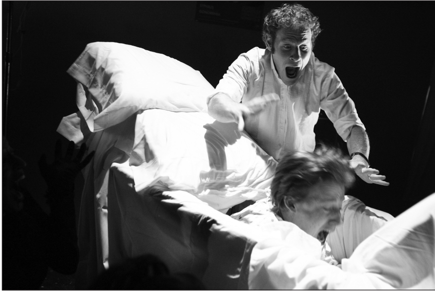
Figure 4. “Clinic—Steve to Hell,” scene from Hell House.