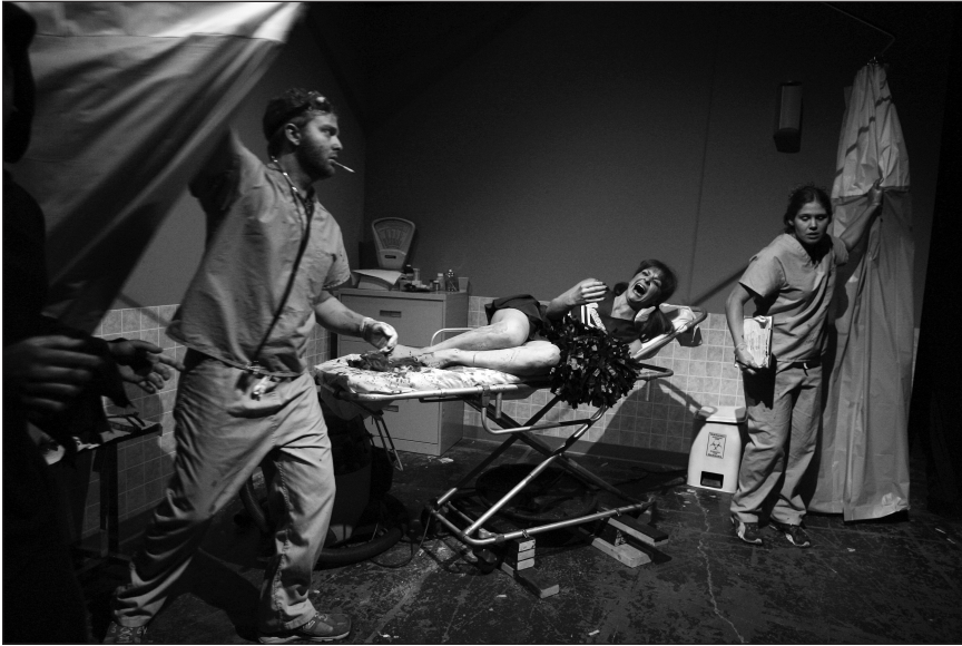
Figure 2. “Abortion,” scene from Hell House .

It is interesting to speculate how Les Frères’s Hell House would have changed if the company had done outreach to evangelical churches, in a kind of reverse missionizing. How would Les Frères’s Hell House have appeared—felt—to them? But this would have required recognizing that the religious landscape of New York City already includes many people whose worldview evangelical Hell Houses do accurately capture. It would also have meant confronting some significant overlap between the truth-and-consequences theology of Hell House and the worldviews of many urban “hipsters.” Les Frères’s hipster audience surely included many people who profess pastoral notions of good, spiritually redeeming sex versus bad, corrupting sex or who ascribe to a watered-down version of karmic retribution. For whom, exactly, is a Hell House an otherworldly experience?