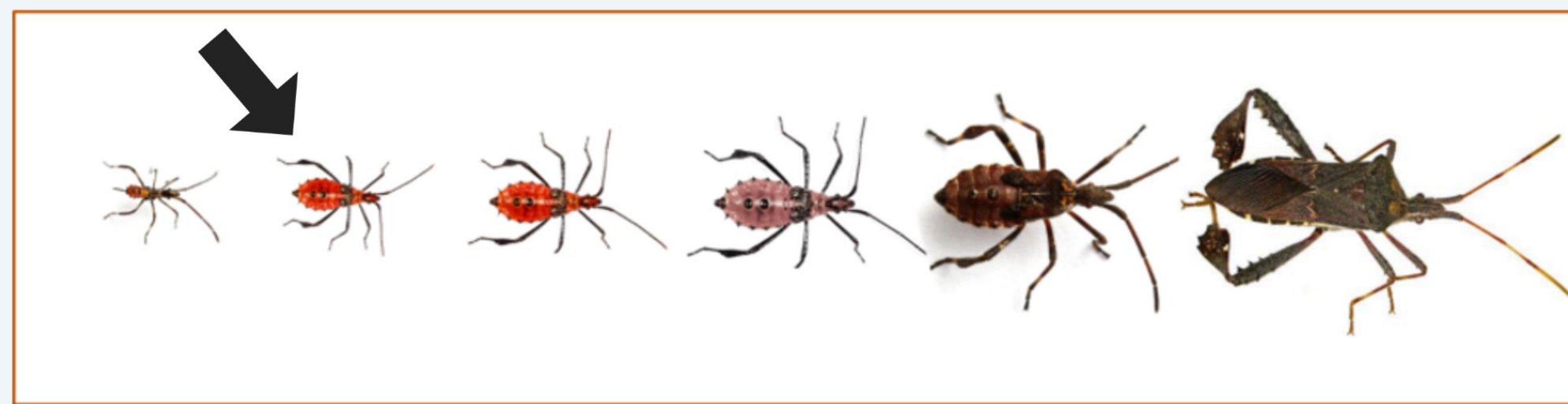
Figure 1: Leptoglossus Zonatus , a close relative of L. phyllopus , developmental stages (instars), from 1 st (left) to adult (right)