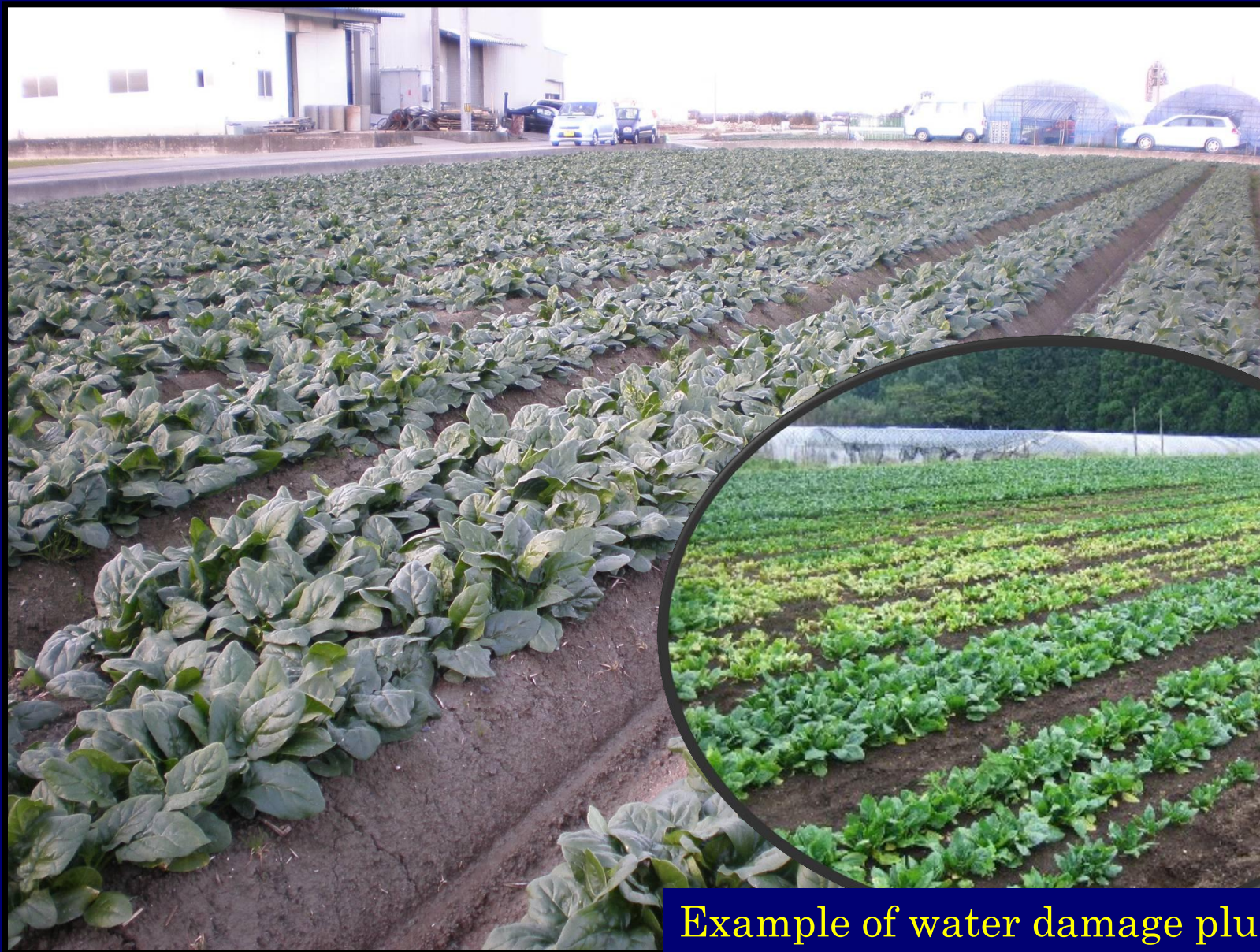
Example of water damage plus virus