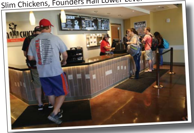
Slim Chickens, Founders Hall Lower Level

Founders Hall, with 214 students, is centrally located near several academic buildings and is attached to Brough Commons. In the lower level Founders houses retail dining concepts including local favorite, Slim Chickens.