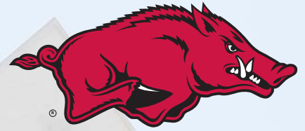
Founders Student Room