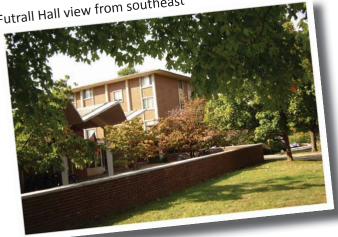
Futtrall Hall view from southeast

Futtrall Hall, with 190 students, is home to the Agriculture, Food and Life Sciences and Health Professions Living Learning Communities. Futtrall features recently refurbished first floor and ground floor lounges.