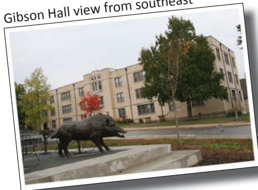
Gibson Hall view from southeast

Gibson is centrally located near several academic buildings and across Dickson Street from Brough Commons. With 98 female students, Gibson features a full kitchen on the second floor and a centrally-located study lounge on the third floor.