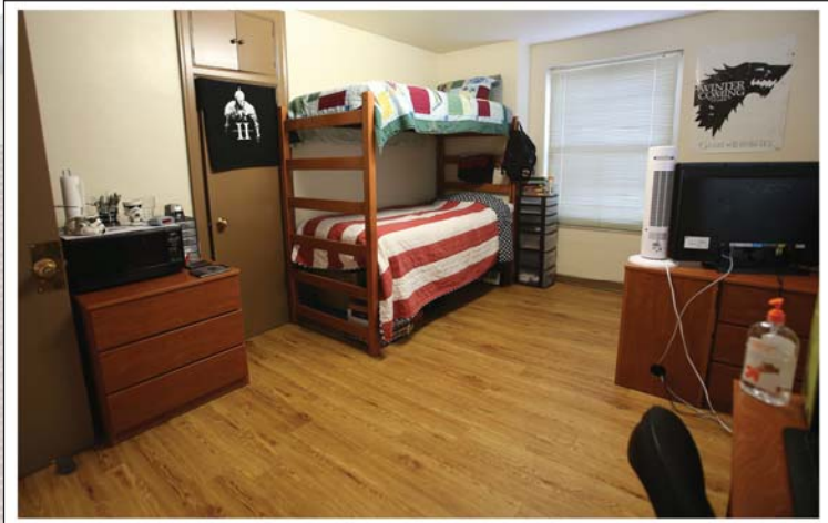
Holcombe Student Room