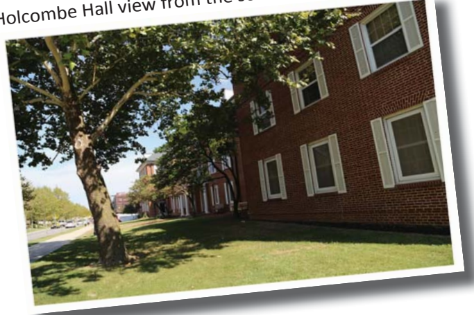
Holcombe Hall view from the southwest

Holcombe is easily recognizable on Garland Avenue by its columned portico. Holcombe features a grand living room and music room on the first floor and a full kitchen and recreation room on the ground floor. The office of International Students and Scholars is located in Holcombe.