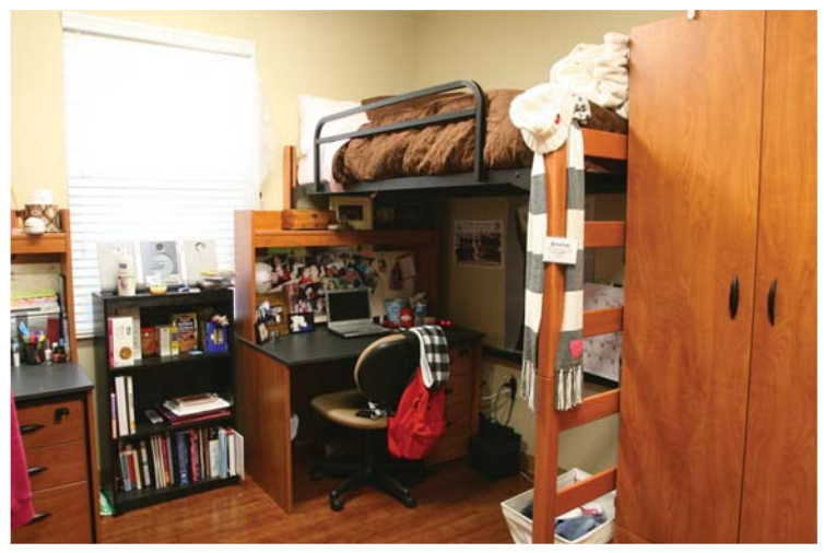
Maple Hill South Student Room