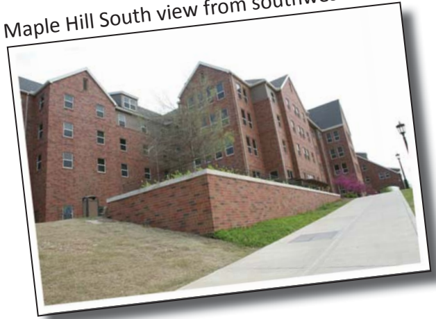
Maple Hill South view from southwest

Maple Hill South houses 356 students in semi-suite double rooms where four students share a bathroom. Each student floor includes a TV/kitchen room, quiet study rooms and group study rooms. Maple Hill South also features a first floor sitting room with fireplace.