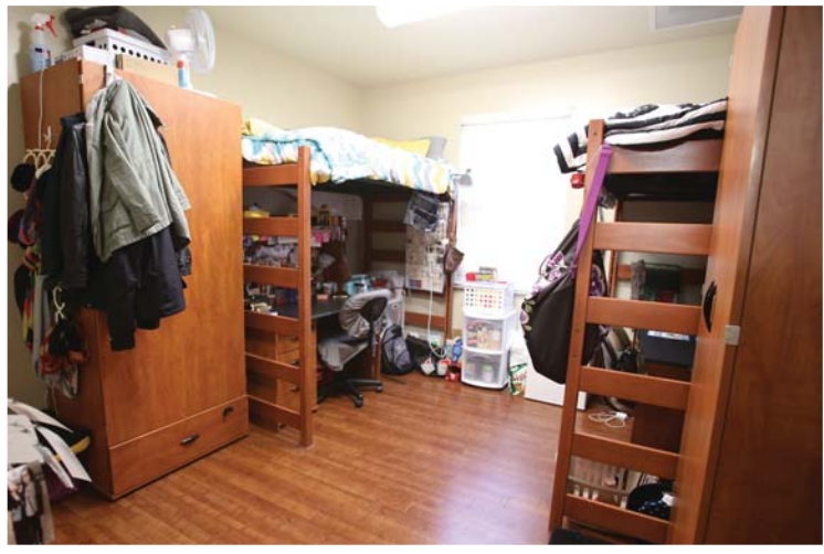
Maple Hill West Student Room