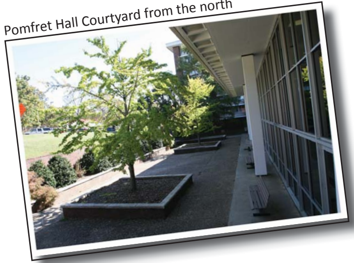
Pomfret Hall Courtyard from the north

Pomfret is the largest residential complex on the University of Arkansas campus, with 800 students in three residential wings. It includes a dining center and ground floor Great Room, a TV and music room and houses the Air Force ROTC, Diversity Scholars and Music Living Learning Communities. It is located on the south end of campus next to the Bud Walton Arena and the Jones Student Athlete Success Center.