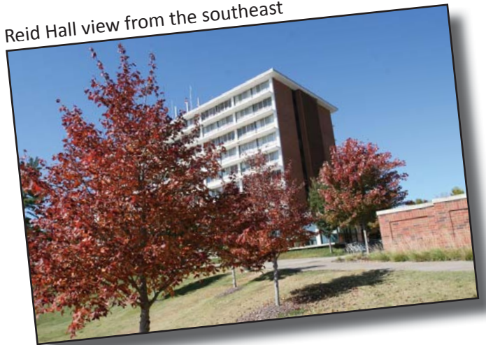
Reid Hall view from the southeast

Reid is a 9-story residence hall housing 458 female students. It is located next to the Epley Center for Health Professions on University Transit routes at the north end of campus. Reid features a large study room, kitchen with TV room and a fitness room on the first floor.