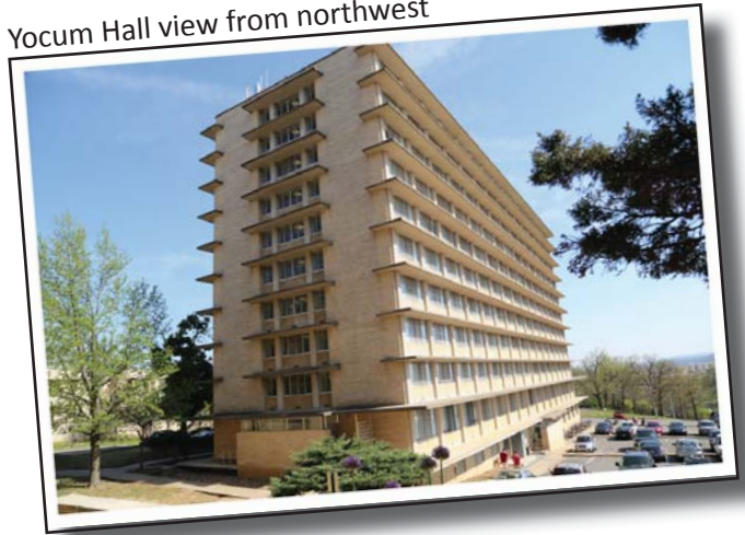
Yocum Hall view from northwest

Yocum Hall, with 540 students, is centrally located near academic buildings and dining service at Brough Commons. Yocum features a first-floor TV lounge and ground-floor game room. Student rooms include standard double rooms and air-chase rooms.