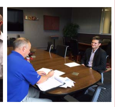
Mock Interviewers Providing Students with a Face-to-Face Opportunity to Gain Experience

the number of interviewers from 8 in 2014 to 16 in 2015. We were able to interview 40 students, and for the first time provide many of the students with interviews that had multiple interviewers.