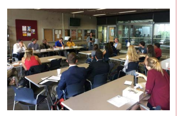
Mock Interviews Q&A Panel Session

from an industry veteran. We will be tracking how many times the guest lecturers are used during the school year.