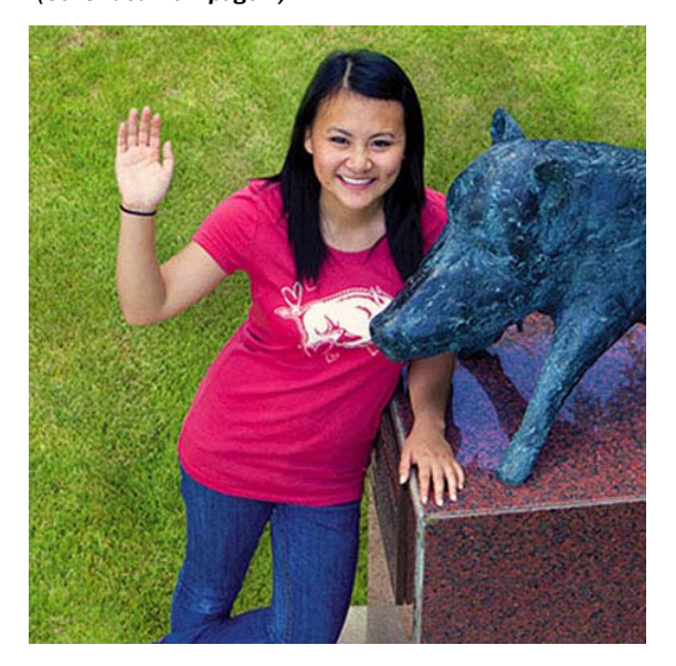
Generation Z Using the "Hi Mom" Webcam

memories of pep rallies in the Chi Omega Greek Theatre.