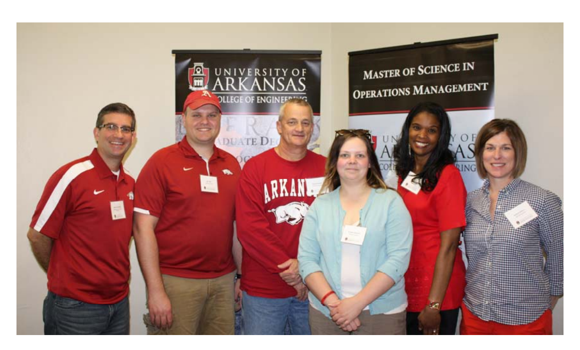
Students and Staff at the 40th Anniversary Celebration

For more about the MSOM program, go to operations-management.uark.edu