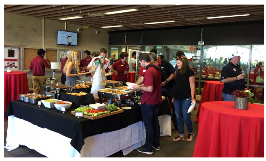
Mentor Circle kick-off at the Department 65th Anniversary Celebration