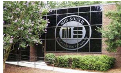
Cary, North Carolina location

Today Mid-South Engineering employs 115 employees in their two locations, the Hot Springs complex and a facility in Cary, North Carolina which was purchased 4 years ago to accommodate their growing client base.