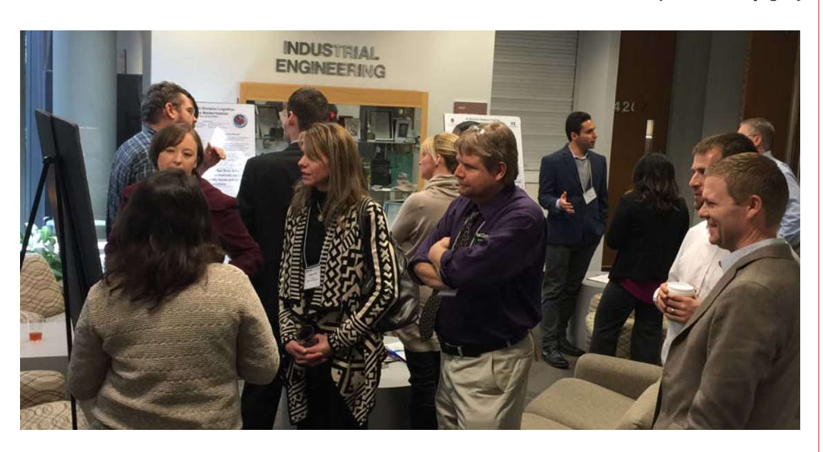
Students and professors from a variety of CELDI universities exchange ideas with industry and government member organizations in poster sessions held at meetings around the country several times per year