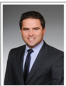
Rep. Warwick Sabin (D) District 33 Co-Sponsor: HB1892