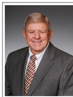
Rep. Dwight Tosh (R) District 52 Lead Sponsor: HB1779