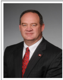
Sen. Jimmy Hickey