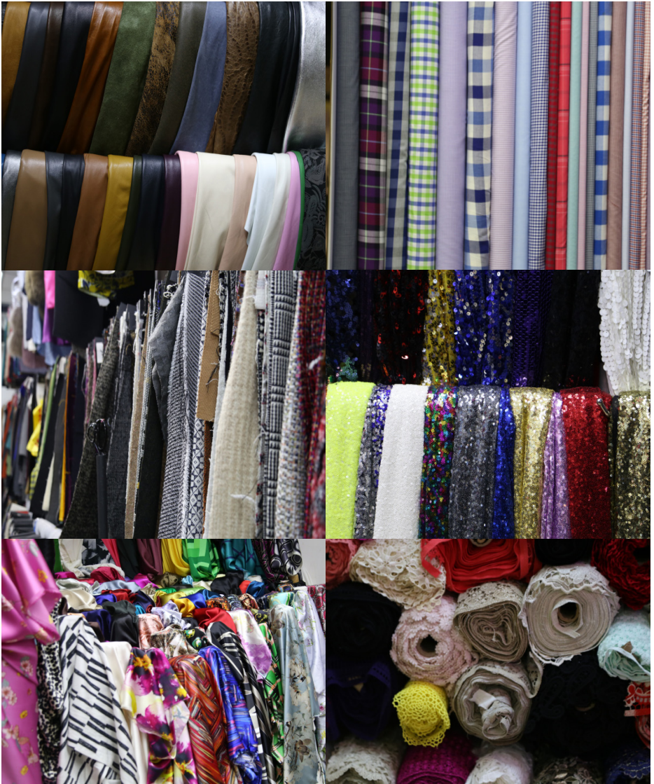
From left to right: leather, cotton, tweed, sequins, silk, lace

People can find different kinds of fabrics at this market such as those shown in the previous photos and many others. We interviewed the owner of the leather shop, who told us most of his clients are foreigners and the price of a jacket starts at 1000 RMB. His stock is mostly sheep leather.