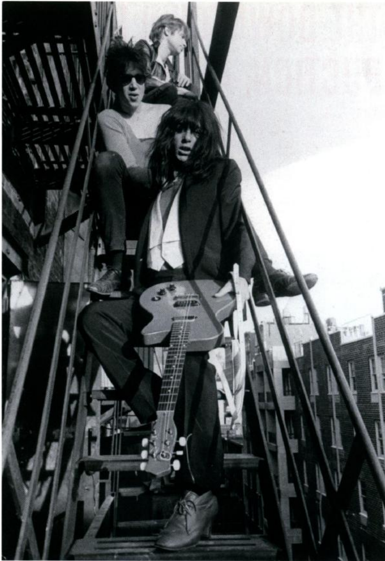
JOHNNY THUNDERS, RICHARD HELL, AND JERRY NOLAN ON A DOWNTOWN FIRE ESCAPE, 1975.