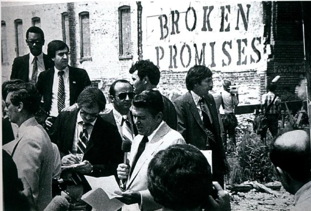
BOTTOM: RONALD REAGAN STANDING BEFORE JOHN FEKNER'S MURAL BROKEN PROMISES , 1980.