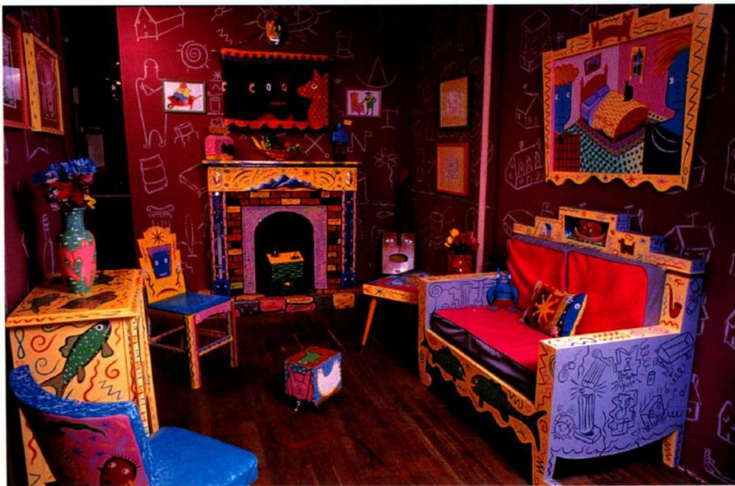
RODNEY ALAN GREENBLAT, INSTALLATION VIEW OF EXHIBITION AT GRACIE MANSION GALLERY, 1983.

a desire to use art in refabricating a basis for individuality in the face of our sharpened sense of the structural determination of our lives. . . . Far from being defeated by contradictions, these postmoderns take from it the cue for an alternative logic. Far from being rendered hopeless by the seemingly inevitable drift of (inter)national politics, they borrow from disinformation the ironic habitation of familiar forms for cross-purposes. Far from being paralyzed by the anxiety of past masters' influence, they appropriate them for commentary on classic motifs (such as mastery, originality, autonomy, representation) and art-world structures (such as publishing houses, galleries, museums, and criticism). Far from feeling compromised by the investment economics of art, they turn the art market into a microcosm of consumer capitalism. 8