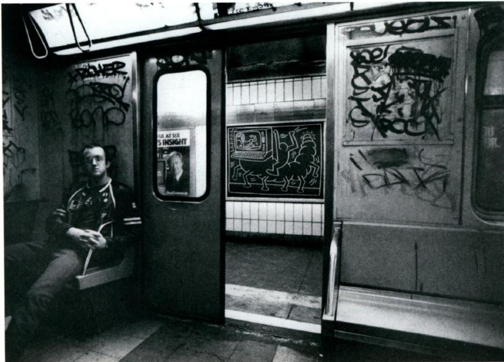
KEITH HARING IN SUBWAY CAR, c. 1982–85.