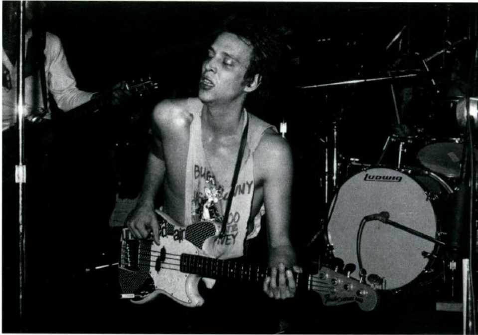
RICHARD HELL PERFORMING IN A T-SHIRT PROCLAIMING "BUGS BUNNY HAS TOO MUCH MONEY." Richard Hell Papers, Fales Library.

experimental, outsider, and avant-garde artists working in Downtown New York during the seminal decade 1974–84. It brings together essays by some of the leading scholars, writers, and other people who were part of the Downtown scene. By viewing Downtown as both geography and metaphor, we can begin to understand how this place, during this period, shaped creative culture in the United States over the past twenty-five years.