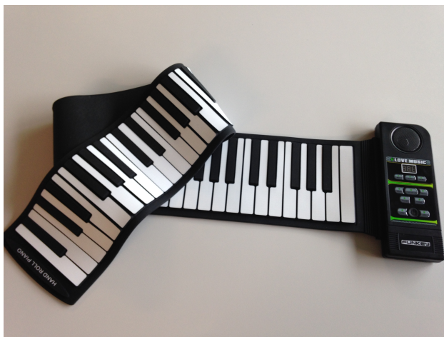
Figure 2. The portable piano that we will use for the demo.

Again, we hope to be able to demonstrate this to the public at a later stage.