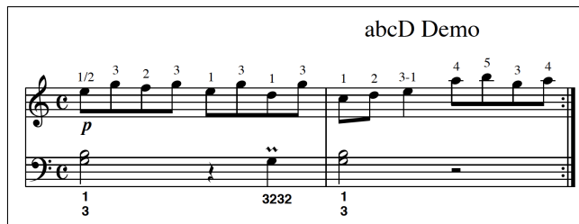
Figure 2: Rendered abcD file fragment.

The extended Bachus-Naur form (EBNF) grammar displayed in Listing 2 is rendered into a PEG.js [7] transformer to allow parsing of the abcD file by abcDE.