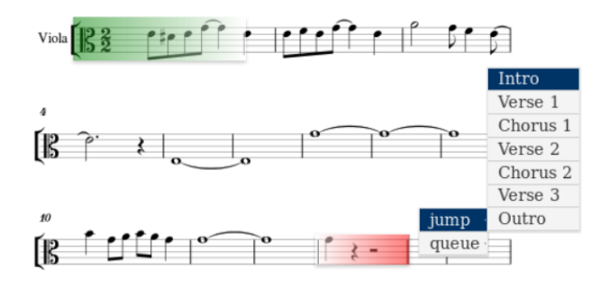
Figure 2 . Screenshot illustrating a call-out requesting performers to jump from the end of the 13th measure back to the introduction. In jumps across pages, users can click on the jump source (red highlight) to switch pages appropriately in order to land at the jump target (green highlight).

A screenshot of the system in action is provided in Figure 2. The client is capable of filtering multi-voiced MEI files to only show portions of the score relevant to the respective performer, via a simple XML transform using XPath; the MEI file displayed in the screenshot encodes a score for a string quartet, filtered to show only the viola part. Within the MEI hierarchy, voice-specific layers are situated underneath the level of measures. Thus, annotations targeting individual measures remain visible to each performer, even if those measures are located on different pages of the score according to the layout requirements of the respective voices being rendered.