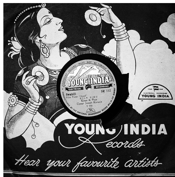
Figure 1. A Young India record in its original packaging.

That the popularity of Indian taarab continued to grow during the 1950s is suggested by the success of an odd mini-genre of Swahili-language Bollywood contrafacta produced in India, by Indians .