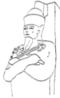
Figure 1: Anthropomorphic Column - Osiris-pillar from the Temple of Hatshepsut. Deir-el-Bahari. 18th dynasty. 17