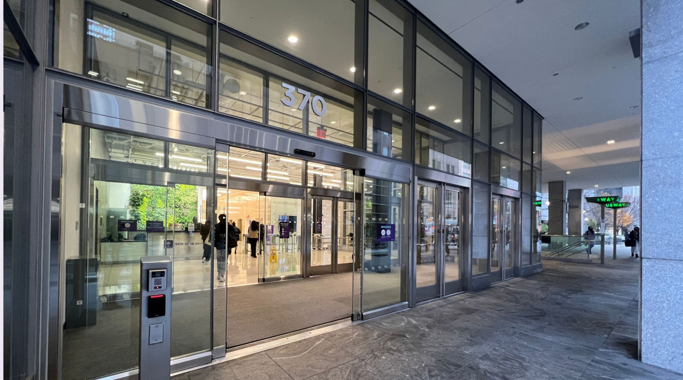
Main entrance to the building on 370 Jay Street.