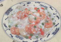
Shrimp w. Lobster Sauce