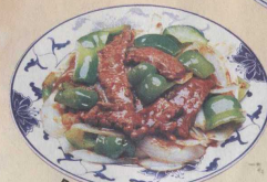
Pepper Steak w. Onions