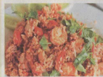
Shrimp Basil Fried Rice