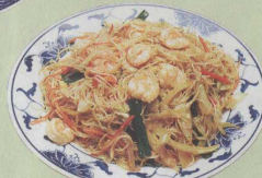
Singapore Mei Fun