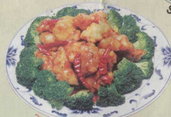
General Tso's Chicken