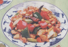
Kung Pao Chicken