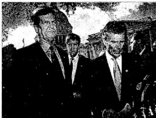
Senate Majority leader Thomas Daschle, right, and Minority Leader Trent Lott hold a news conference at the Capitol.

The Federal Aviation Administration announced that it will require critical backbone stocks on all